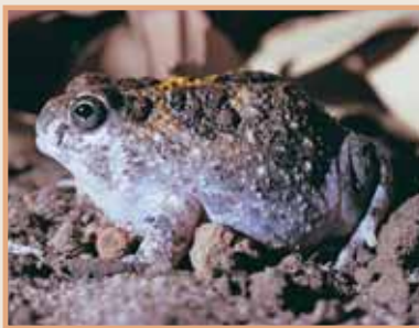
Northern Spade Foot Frog