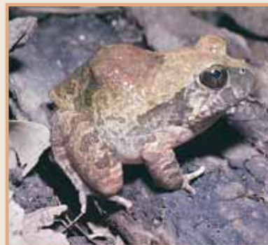
Ornate Burrowing Frog